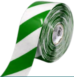
WHITE w/ GREEN CHEVRONS