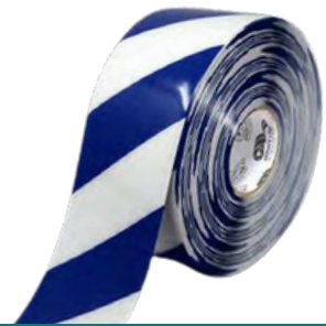
WHITE w/ BLUE CHEVRONS