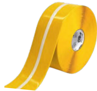
YELLOW w/ LUMINESCENT CENTER LINE