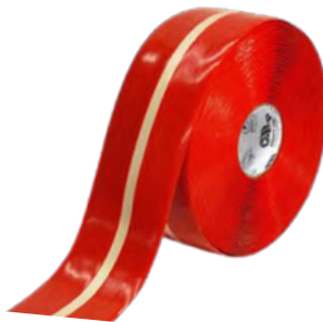
RED w/ LUMINESCENT CENTER LINE