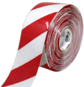
WHITE w/ RED CHEVRONS