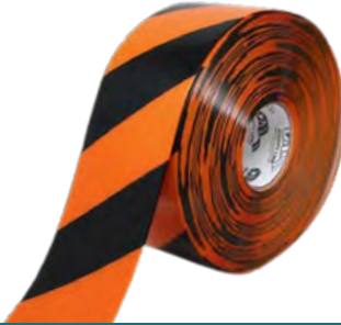
BLACK w/ ORANGE CHEVRONS