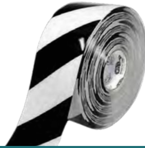
WHITE w/ BLACK CHEVRONS