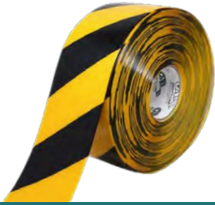
YELLOW w/ BLACK CHEVRONS