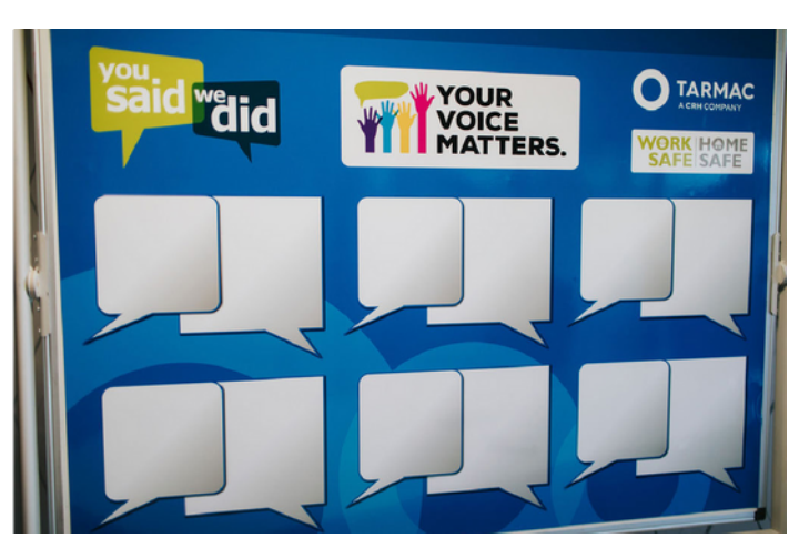
YOU SAID WE DID BOARDS