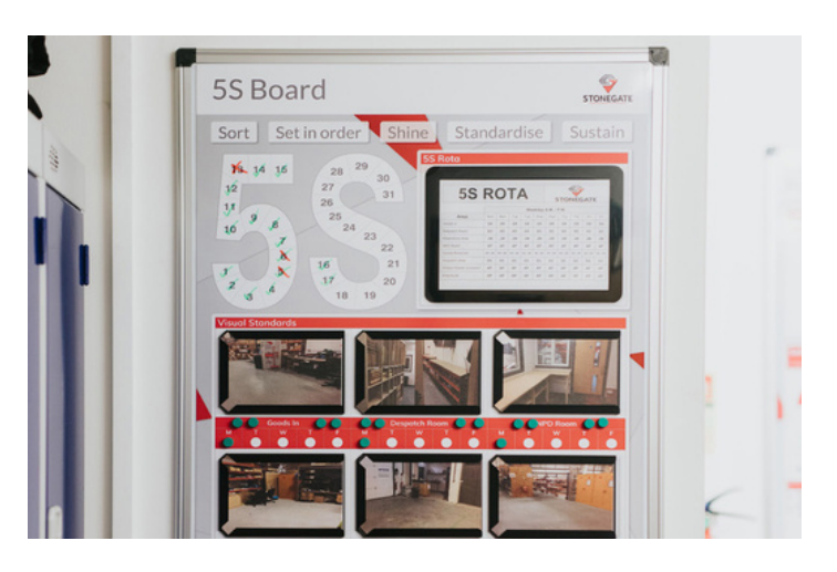
5S & 6S BOARDS